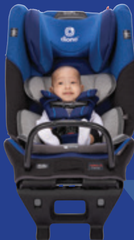
Newborn rear-facing From 4 lb / 1.8 kg