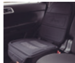
Seat Guard Complete