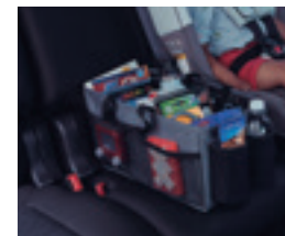
Travel Pal™ XL