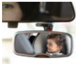
See Me Too™