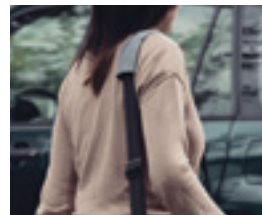
Universal Carry Strap