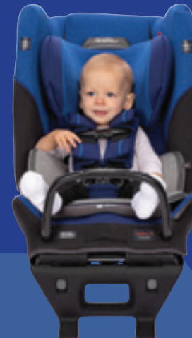
infant rear-facing Up to 50 lb / 22.7 kg