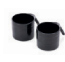
Cup Holder - 2 Pack