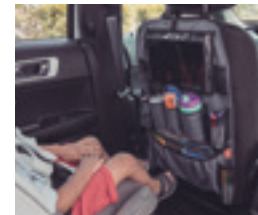
Stow 'n Go™ XL