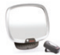
Easy View™ Plus Mirror