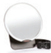
Easy View™ Mirror