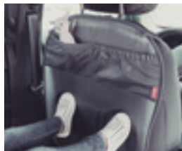
Stuff 'n Scuff™ XL