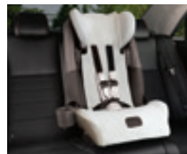
Summer Cover - available summer 2020