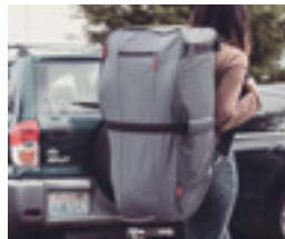
Car Seat Travel Backpack